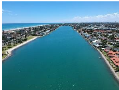
Aerial view of international regatta course