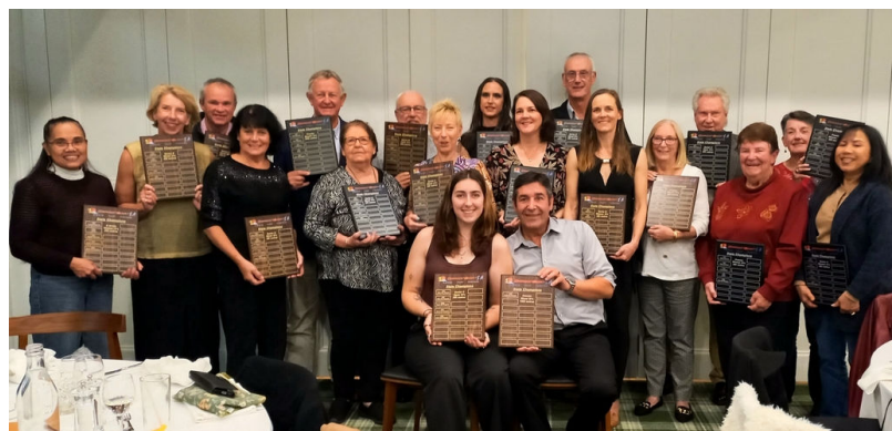
Black Sea Dragons

A heartfelt thank you to everyone who joined us and helped make the night memorable and congratulations to all recipients of awards.