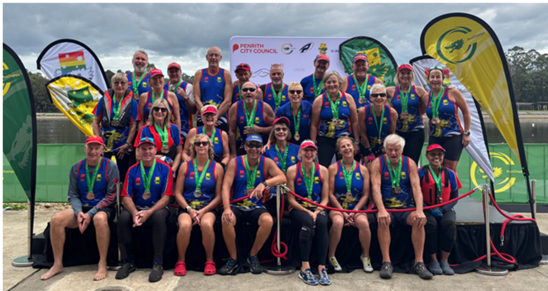
Some of our State Team Medallists