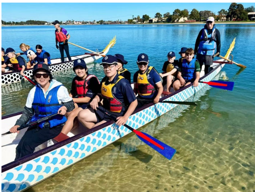
Students from Pulteney Grammar school pictured.

A highlight of the season was the successful delivery of its largest-ever Come N Try event, welcoming 300 students from St Michael’s College to experience the sport of dragon boating.